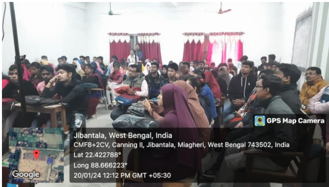
Students and faculties are attentively listening to the seminar