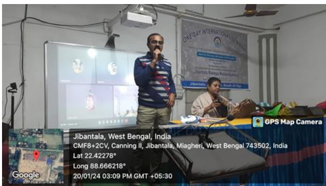
Participant presenting his paper

EMAIL ID:- internationalseminarjrm@gmail.com