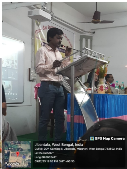
Jibantala, West Bengal, India CMF8+2CV, Canning II, Jibantala, Miagheri, West Bengal 743502, India Lat 22.422797° Long 88.666244° 09/12/23 12:53 PM GMT +05:30