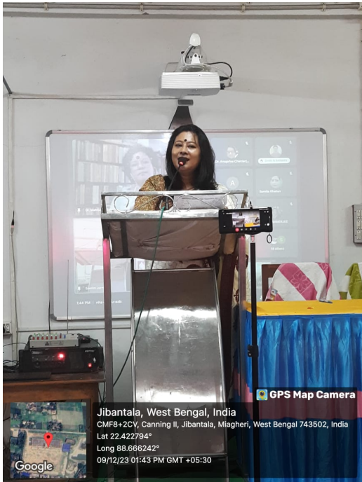
Jibantala, West Bengal, India CMF8+2CV, Canning II, Jibantala, Miagheri, West Bengal 743502, India Lat 22.422794° Long 88.666242° 09/12/23 01:43 PM GMT +05:30