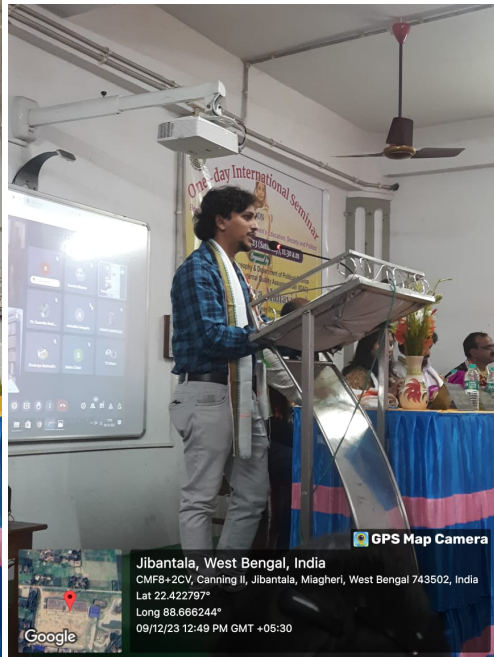
Jibantala, West Bengal, India CMF8+2CV, Canning II, Jibantala, Miagheri, West Bengal 743502, India Lat 22.422797° Long 88.666244° 09/12/23 12:49 PM GMT +05:30