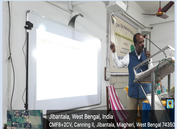
Jibantala, West Bengal, India CMF8+2CV, Canning II, Jibantala, Miagheri, West Bengal 743502