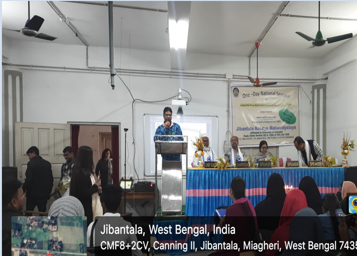
Jibantala, West Bengal, India CMF8+2CV, Canning II, Jibantala, Miagheri, West Bengal 743502