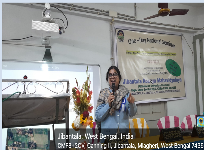
Jibantala, West Bengal, India CMF8+2CV, Canning II, Jibantala, Miagheri, West Bengal 74350