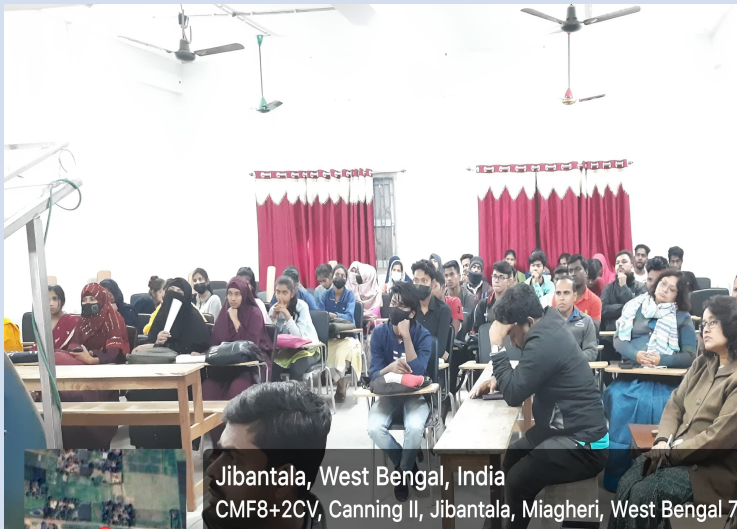
Jibantala, West Bengal, India CMF8+2CV, Canning II, Jibantala, Miagheri, West Bengal 743502