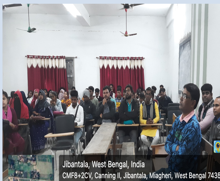
Jibantala, West Bengal, India CMF8+2CV, Canning II, Jibantala, Miagheri, West Bengal 74350