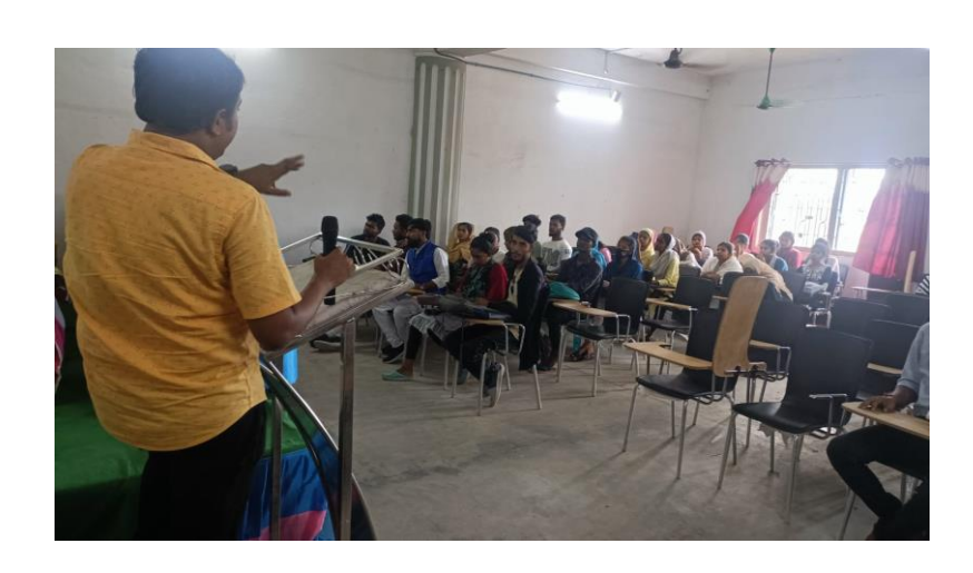
Felicitating the Speaker